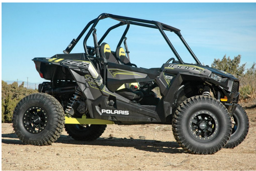
http://utvactionmag.com/wp-content/uploads/2016/07/ARISUN1_DSC_2158 Arisun's Aftershock XD tires on Raceline Black Mamba beadlock wheels are a rugged combination that will give your UTV a more aggressive and personal style to UTVs and ATVs.

Raceline's Black Mamba beadlocks are cast-aluminum single-beadlock wheels with a forged-billet outer ring and a reinforced inner lip. Sixteen bolts retain the ring on 12-inch wheels, and 20 bolts are used on 14- and 15-inch sizes. Black Mambas are $180 in the 14-inch size, which is $10 to $15 more than some other single-beadlock wheels.