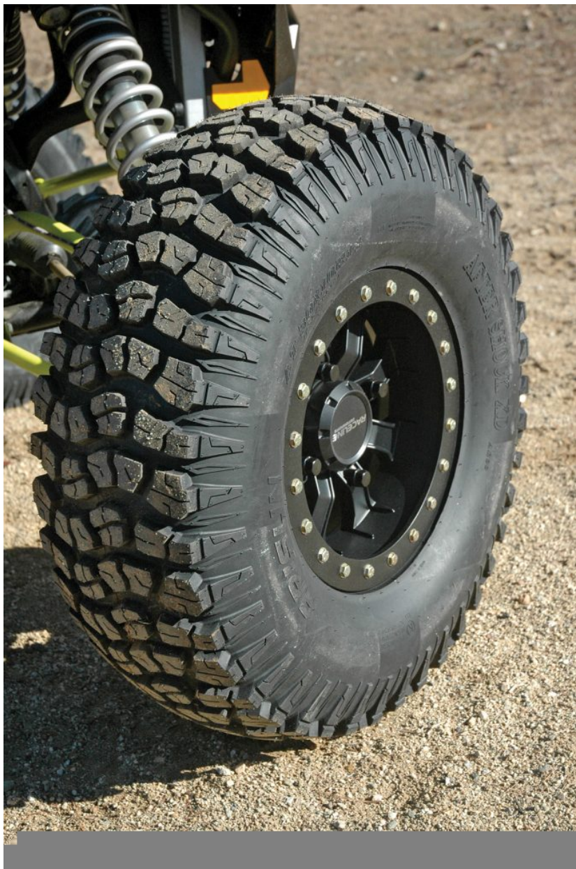
( http://utvactionmag.com/wp-content/uploads/2016/07/ARISUN2_DSC_2166.jpg )

The Aftershock XD's smooth ride was instantly noticeable on hard terrain, as was its impressive traction on slippery hardpack with loose material on top. No matter where we went, this tire's cornering grip and crisp cornering feel made the RZR's handling feel precise. The tight tread grouping also worked well on bare rock, and the tire endured trails loaded with loose, jagged rocks with no punctures or tread damage. When running low pressures or traveling where flats are likely, it was reassuring to know the Raceline beadlock wheels had a secure grip on the beads. The Black Mamba's beadlock ring bolts are semi-countersunk to keep the bolt heads from being beaten up by rocks. In soft soil and sand, the tires worked well, but didn't offer the traction of tires designed for softer conditions. Arisun has a full line of tires to handle soft/intermediate terrain, as well as dedicated mud tires.